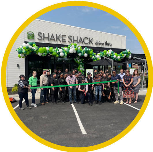
SHAKE SHACK (Grand Opening of New Location) 1430 Harrisburg Pike Lancaster, PA 17601