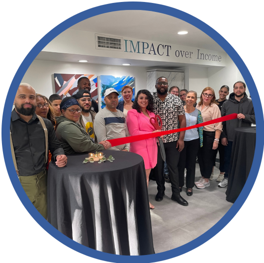
IB Advisors Power by FWA (Celebration of Opening of Location) 52 North Queen Street, Suite 2A Lancaster, PA 17601

Congratulations to the Businesses who had ribbon cuttings this past month! The Lancaster Chamber is honored to be invited to be alongside these businesses and their teams as they celebrate grand openings and business milestones. Learn more about the business, their stories, and the services they provide to our community.