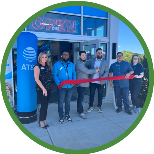
ATT Wirelss Experience (Grand Opening of New Location) 2418 Willow Street Pike, Lancaster, PA 17602